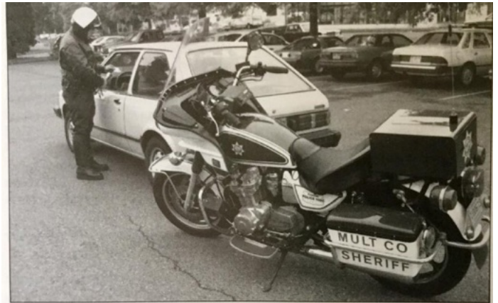
Lt. Kirby Brouillard, Commander of the MCSO Motorcycle Unit, demonstrates a DUII traffic stop. Motorcycle patrol officers use high-tech, passive alcohol sensing devices, known as PAS, to aid in detecting drunk drivers. The device alerts to ethanol, found in alcoholic beverages, and gives the officer probable cause to investigate for drunk driving. The officers will call for patrol cars to transport drunk drivers to jail.